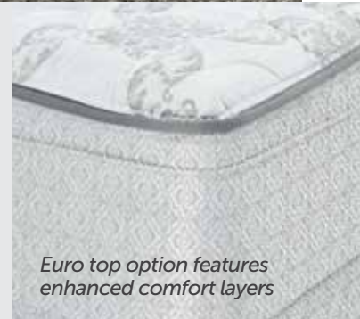
Euro top option features enhanced comfort layers

Give your guests the comfort they expect. With the value of affordable style, the Adri Signature features more durable, comfort-enhancing components than ever before available in a Sealy® mattress.